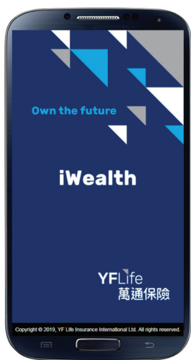
iWealth投資大計應用程式 iWealth Application

e-Market Express 1 - Sends a monthly e-mail to you with the latest market information and investment performance reports of your choice.