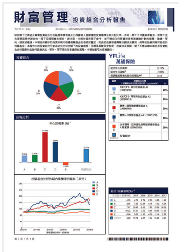
投資組合分析報告 Portfolio Investment Report