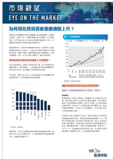
市場觀望 Eye on the Market