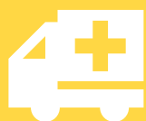
緊急支援 Emergency Assistance

At YF Life, we constantly strive for excellence and are committed to providing our customers with professional and caring services to support them in responding to urgent needs. Through YF GO!, our one-stop value-added service platform that delivers the right assistance at the right time to help our customers take good care of themselves and their family's well being. With YF GO!, our customers enjoy multiple coverages and assistance in the different stages of life, enabling them to manage life with confidence and live it to the fullest.