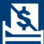
出院免找數服務 Cashless Arrangement Service